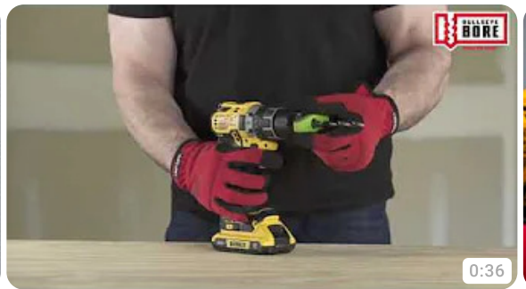
BullseyeBore Core - Quick & Easy Drill Attachment & Detachment 901 views · 1 month ago